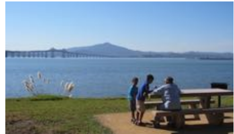
Point Molate Beach Park

EBRPD retained NCE to design and help obtain permits for a 2.5-mile section continuing the Point Molate Trail from the bridge to the northern border of the City's Point Molate property. This includes 1.1 miles on a shoreline easement donated by Chevron and 1.4 miles on City property. Click Here for more information.