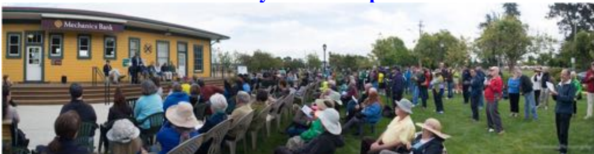
May 31 Celebration for Completion of Ferry Point Loop

The City finished the Plunge section of the Bay Trail along Garrard Blvd. between Cutting Blvd. and the Ferry Point tunnel. This completes the 4.4-mile Ferry Point Loop encircling Miller/Knox Regional Shoreline. An additional 0.5-mile shoreline trail will be incorporated in the residential development planned on the City's historic Terminal One property at the foot of Dornan Drive.